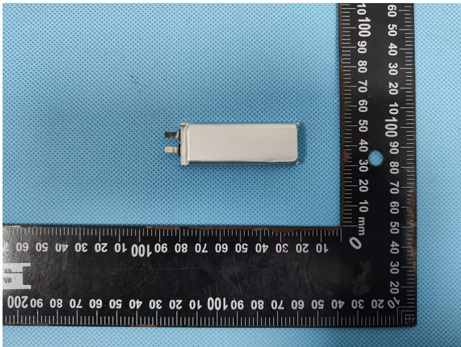
Photo 4 电池背面 Back view of Cell