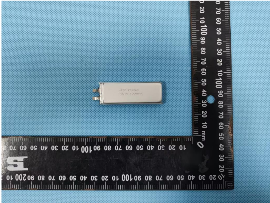
Photo 3 电池正面 Front view of Cell