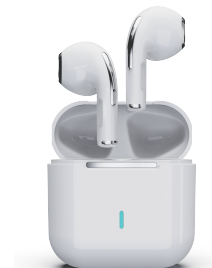
TWS Wireless stereo headset