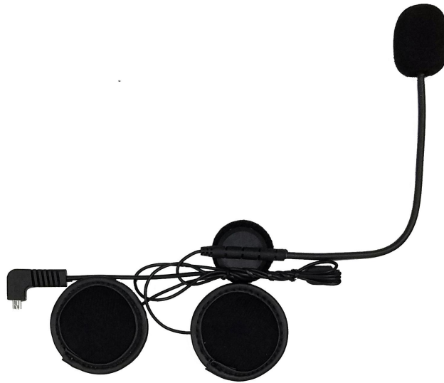
②Microphone&Speakers (including headphone velcro)