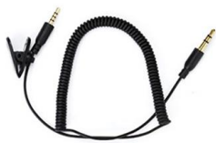
⑤ Audio Cable