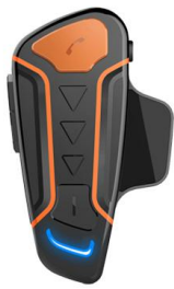
① Bluetooth Device